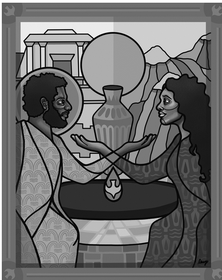
Living Water by Lauren Wright Pittman