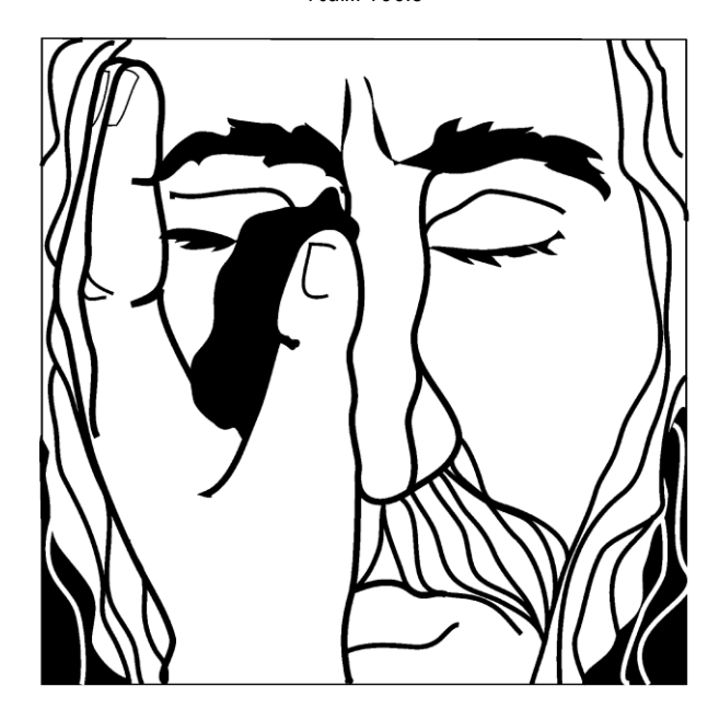
Midweek Lenten Worship Open Our Eyes, God

A Congregation of the Evangelical Lutheran Church in America ... We Are God's People and the Sheep of God's Pasture ... Psalm 100:3