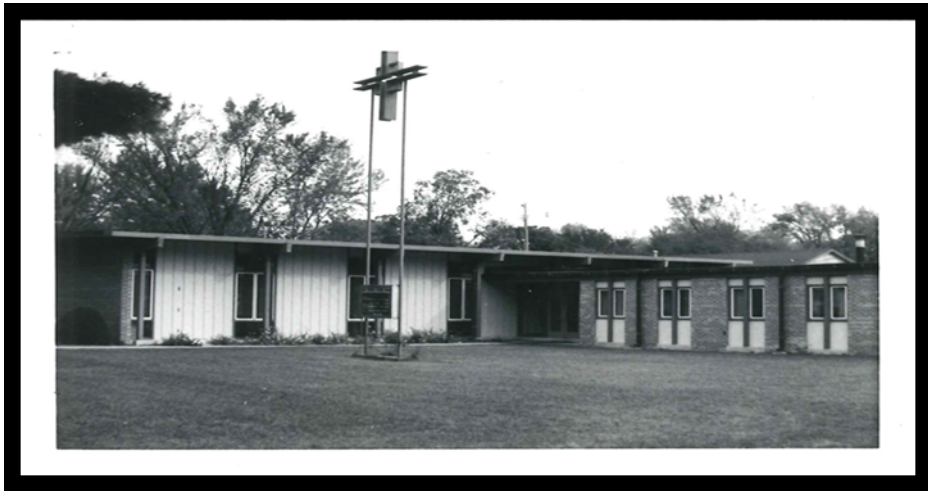
Building in 1958

CELEBRATING 60 YEARS CONNECTING, GROWING, AND EMPOWERING Good Shepherd Lutheran Church 1958 – 2018