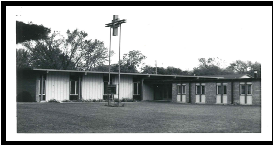
Building in 1958